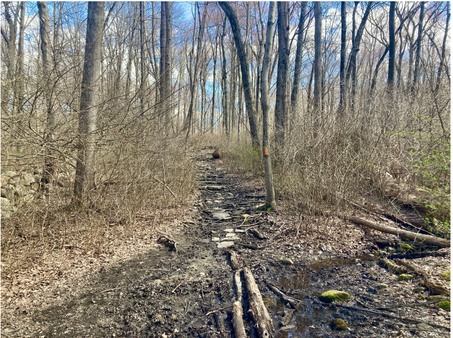
Trail through exotic invasives in the upper eastern wetland on town property

Invasive control on the town property as you deem appropriate – see appendix.