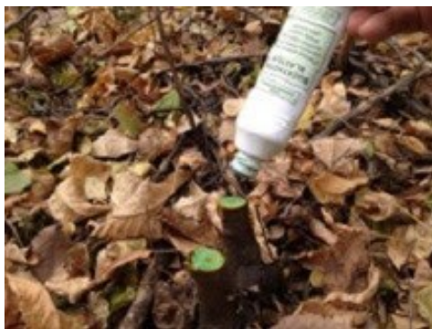
Buckthorn Blaster herbicide applicator for vine and invasive shrub eradication

Control methods include mechanical and chemical methods. In a shady forest, cutting a vine is enough to kill it. Invasive shrubs are not so easy. Pulling the invasives out by the roots can be effective, but extremely difficult and labor intensive. Yearly cutting back of the aboveground stems, during the growing season, will keep the invasives under control, and perhaps kill them after a few years. The most effective control method is to apply an herbicide to the green foliage, and to cut the larger invasive shrubs and treat stumps with a herbicide to prevent resprouting.