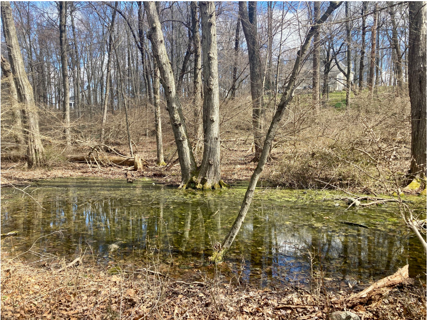
Eastern Vernal Pool

This mature forest is storing a large amount of carbon while actively sequestering more. Any forest products you produce will help mitigate climate change. There are some recommendations below to make forest more resilient and adaptive to climate change. There is more information about forest carbon and the forest's ecological services in the appendix.